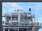
TRAY HH - Horizontal