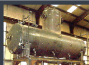
TRAY TC - Tank Car