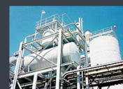
TRAY DS - Double Shell