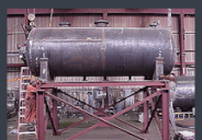
SPRAY HS - Horizontal Spray